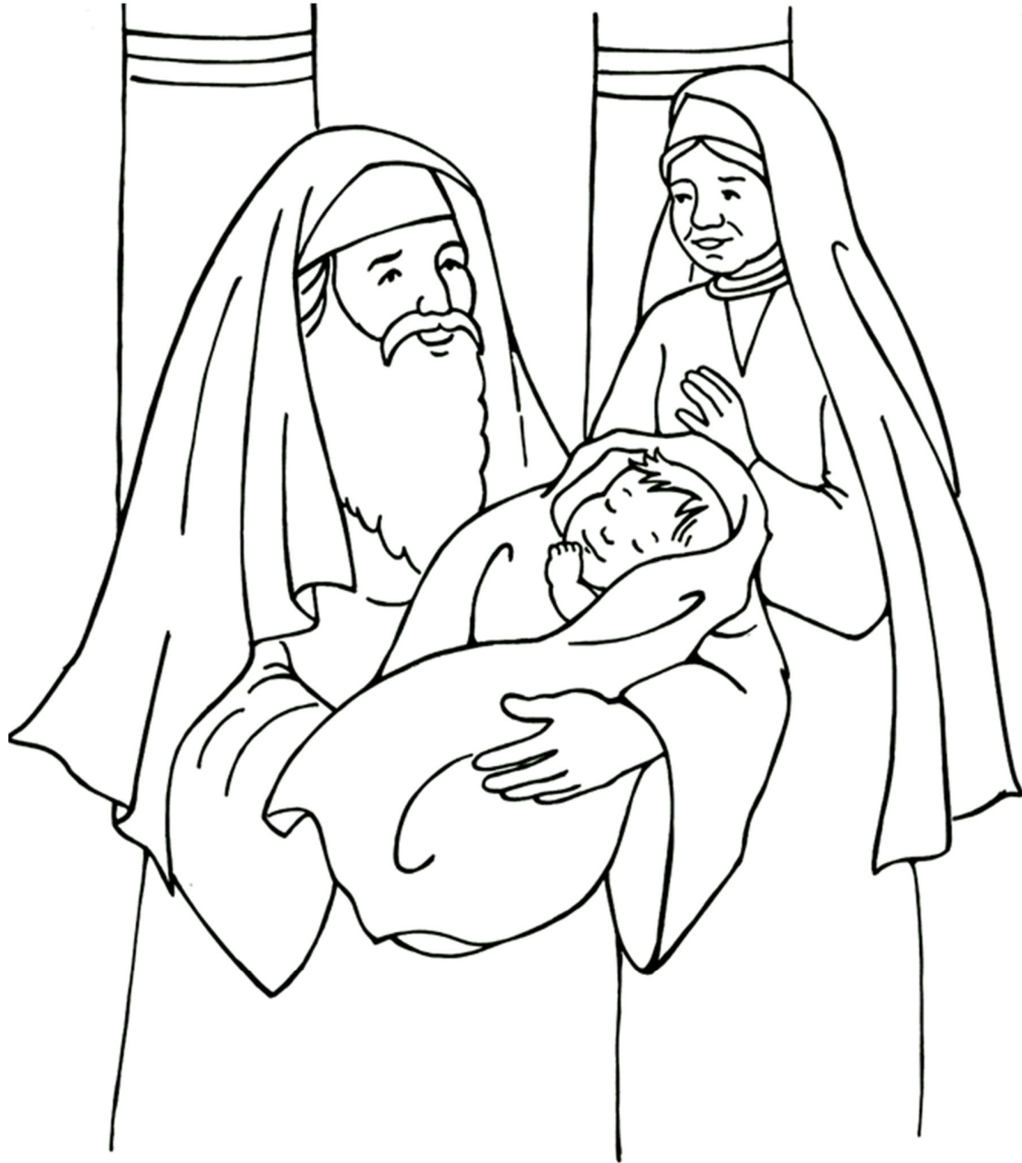
Simeon and Anna Thank God Luke 2